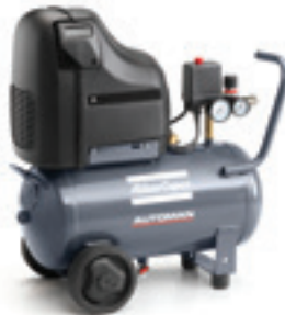
AH 15 E 24