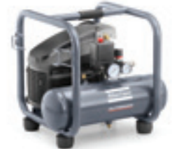
AF 25 E 6

AF Series , 230 V1 phase 10 bars/145 psig for AF 25 , 400 V 3 phases 10 bars/145 psig and 230 V1 phase 10 bars/145 psig for AF30 Direct drive stationary or mobile -9, 10, 2 x 11, 20, 24, 50 or 90 liters horizontal receiver