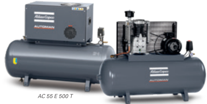
AC 55 E 500 T