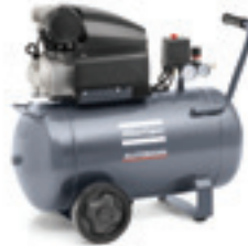
AF 25 E 50