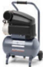
AF 20 E 10