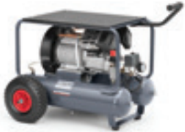
AF 30 E 2X11