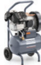
AF 30 E 24