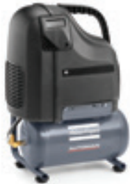
AH 10/15 E 6

AH series oil-free compressors are designed for a variety of applications. With no oil to replace and with the electric motor flanged to the compressor block, maintenance is reduced to the absolute minimum. Their all-aluminium, low-weight construction makes them the ideal choice when a smaller amount of compressed air is sufficient. They can be laid flat for transport.