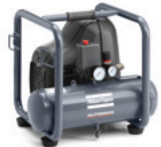
AH 20 E 6